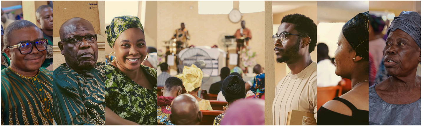
"This is the Lord's doing and it is marvellous in our eyes" - Ps 118:23